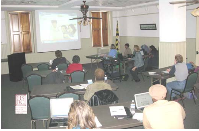
Genealogy Class in Session At HSBC Almshouse.

Thursday, June 12, 2014, at 7:00pm @ Cockeysville Branch - Baltimore County Public library REMEMBERING THE VILLAGE OF TEXAS! Where is it? What was it? How did it come to be?