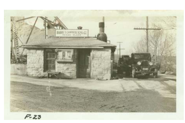
Campbell and Sons scale house, c. 1932.